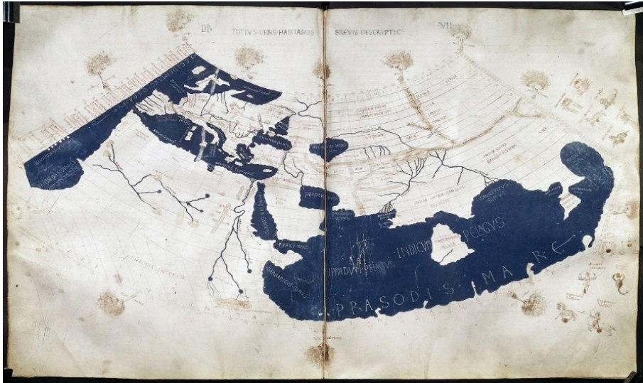
Figure 2: Representation of the Ptolemy Map

Source: Credited to Francesco di Antonio del Chierico, ca 1450-1475, Ptolemy's World Map, available at: < http://commons.wikimedia.org/wiki/File:PtolemyWorldMap.jpg#mediaviewer/File:PtolemyWorldMap.jpg >