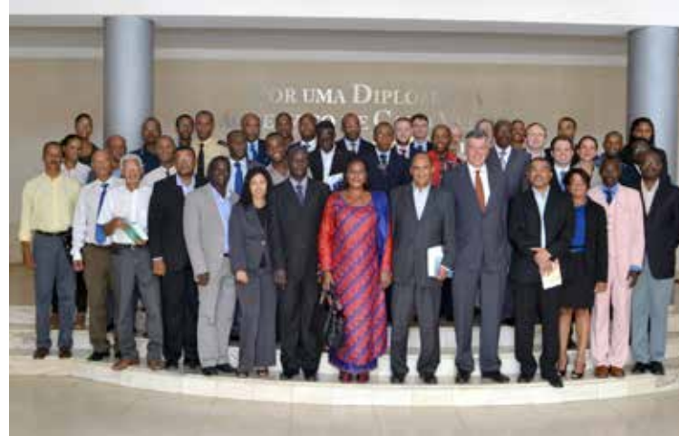
Academics and high-ranking ECOWAS and WAEMU stakeholders at the Ministry of Foreign Affairs in Praia, Cabo Verde, during the joint midterm conference of the WAI-ZEI project in October 2013.