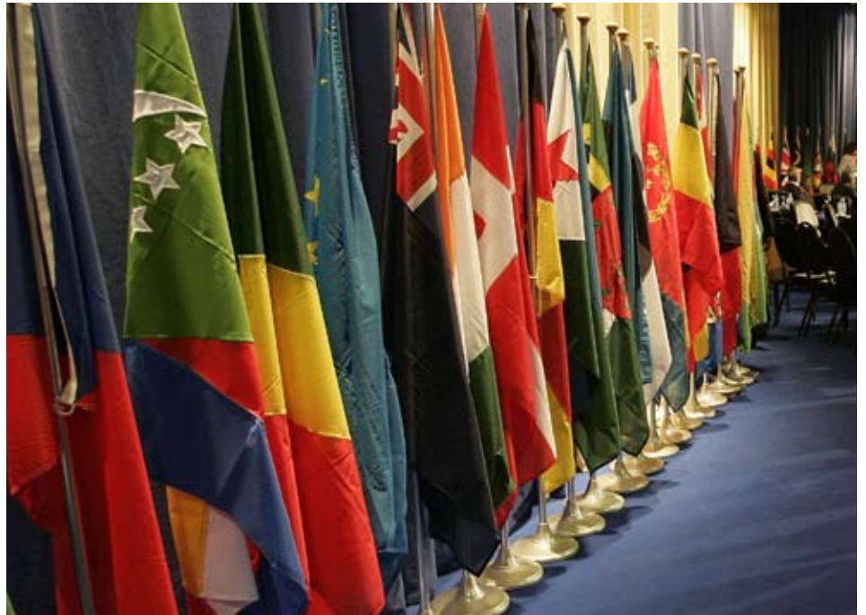
Regions moving together - Colorful flags at the 30th EU-ACP Summit