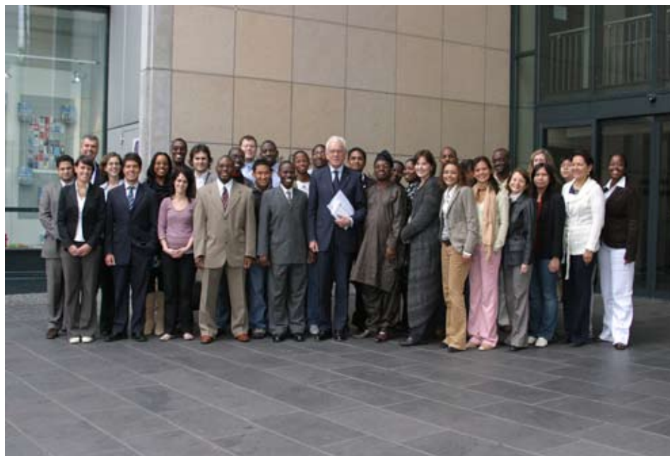
Participants of the ZEI Summer Academy in Comparative Regional Integration with the President of the European Parliament, Hans Gert Pöttering.