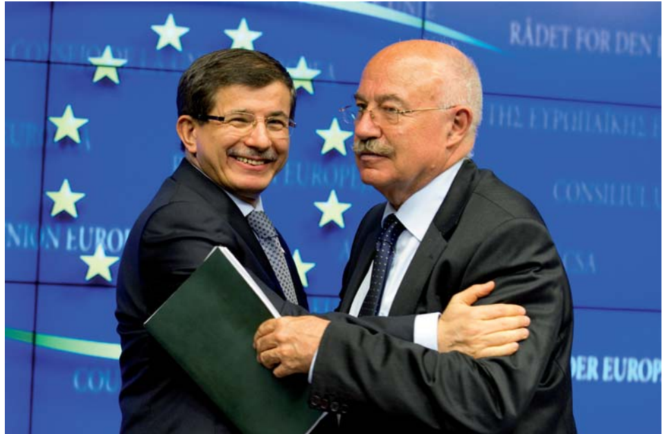
Ahmet Davutoglu, Turkish Minister for Foreign Affairs, and Janos Martonyi, Hungarian Minister for Foreign Affairs, meet at the EU-Turkey Association Council on 19 April 2011 under Hungarian Presidency.