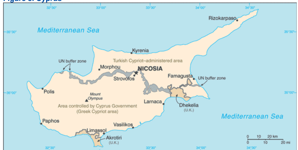
Figure 3. Cyprus