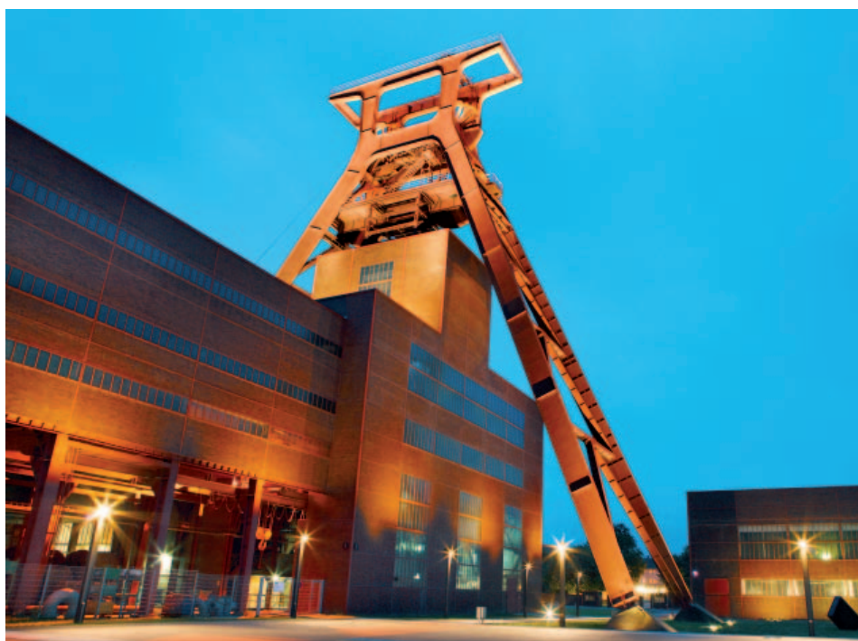
UNESCO World Heritage Site, Zeche Zollverein.

The Capital of Culture's programme “Moving Europe” explicitly addresses ▶