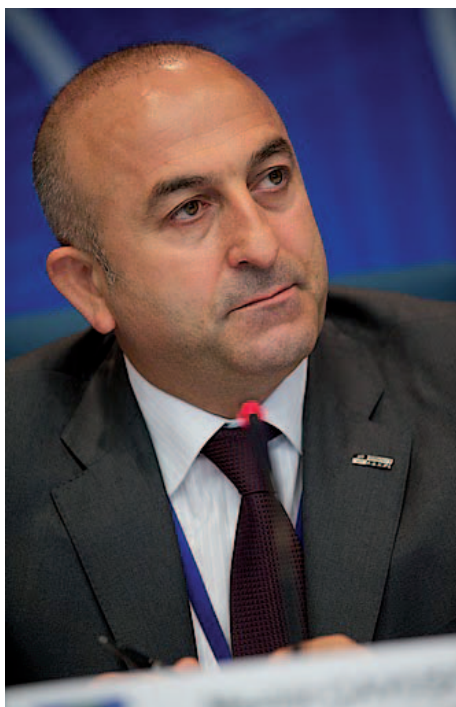
Mevlüt Çavuşoğlu, President of the Parliamentary Assembly of the Council of Europe.

In Bosnia and Herzegovina, we encourage the authorities to make constitutional changes to ensure better political rights for all.