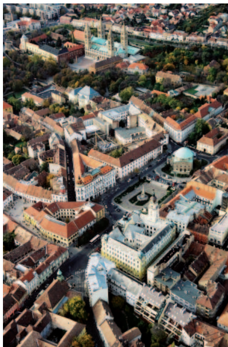
Aerial view of Pécs with the cathedral and the mosque of pasha Gasi Kassim at Széchenyi square.

The year 2010 is looked at as the starting point of a long-term cultural based regional economic development in the life of Pécs. The European Capital of Culture (ECoC) title gave the city a unique opportunity to reach international attention and to show its genuine treasures to the world: its cultural heritage as well as its creativity and openness. The programme is designed to enable the city to rediscover its urban character, the beauty of living in a city, reclaim public spaces for the benefit of its community, and make the whole environment more livable. The ECoC title provides development possibilities not only for the city itself but for the entire South Transdanubian region.