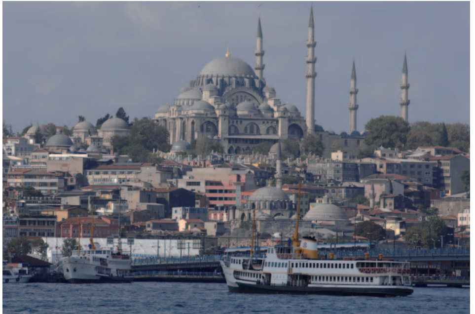
Istanbul as seen from across the "Golden Horn".