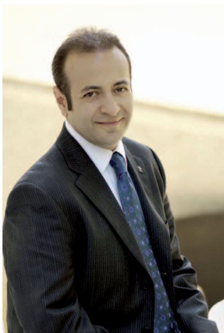
Egemen Bağış, Minister for EU Affairs and Chief Negotiator.

As for the Cyprus issue, the decision of the EU Council of 26 April 2004 to put an end to the unfair isolations imposed on the Turkish Republic of Northern Cyprus has not been implemented yet. The commitments in this respect, such as direct trade and financial assistance, have not been respected.