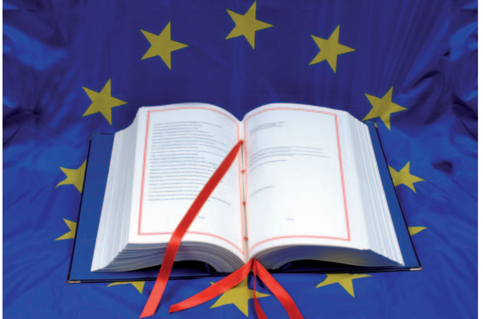
The Lisbon Treaty, signed in 2007, entered into force on 1 December 2009. It lays the foundation for the Union’s procedures, policies, and performance.